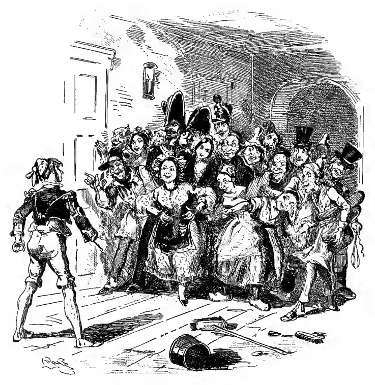
Lorrequer as Postillion.